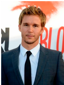
Ryan Kwanten recently filmed the TV pilot, "Edge" in and around Santa Fe.

Edge goes on a bloody mission of vengeance when his younger brother is killed by a group of his former Union army comrades, lead by his nemesis, Merritt Harknett, played by Ryan Kwanten. Edge is described as fearless, intimidating and "the meanest-looking man in any room he chooses to enter."